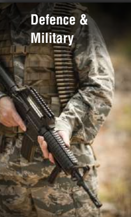
Defence & Military