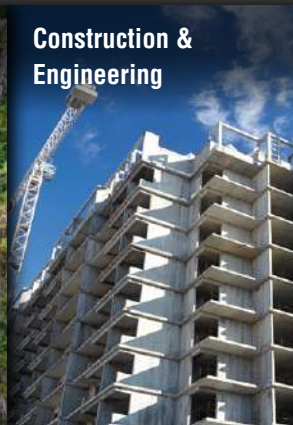
Construction & Engineering